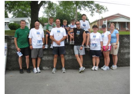
Team Run for God Freedom Run 5K Rainsville, AL

What kind of snares do you have in your life?