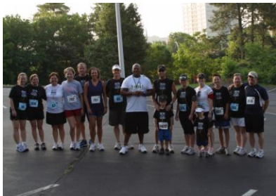
Team Run for God Riverbend Run 5K and 10K Chattanooga, TN

Don't Chance It! – If you feel light headed or dizzy, STOP, walk, and get some fluids and electrolytes in your body. Don't think you can push through it, it's not worth it!